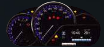
Progressive Optitron Combination Meter with TFT MID

Remarkable design with multi information display.