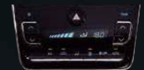
Auto AC with Digital Display

Precision-controlled air flow that lets you enjoy your cruise in perfect comfort.