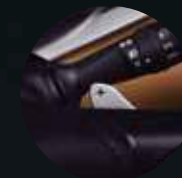
Convenient Paddle Shift

Have fun accelerating in full confidence.