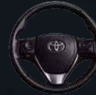
Leather Steering Wheel with Audio & TFT Switch

Effortlessly take control of entertainment unit with the new leathered smart steering wheel.